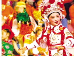
Compulsory Peking Opera course questioned