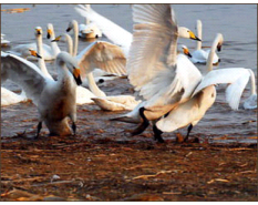
'Paradise' helps white swans survive the winter