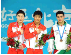
Diver He extends China's winning run at FINA Diving WC